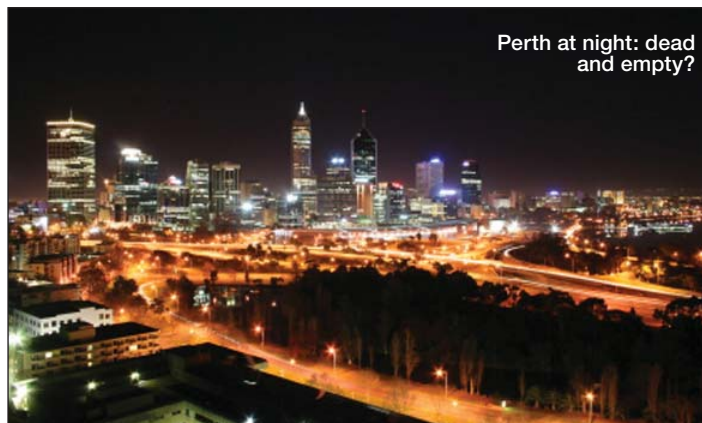
Perth at night: dead and empty?

Gehl recommended increased housing density for the inner city, more student facilities and education